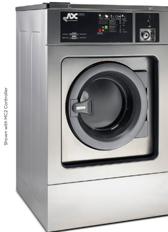
Shown with MC2 Controller