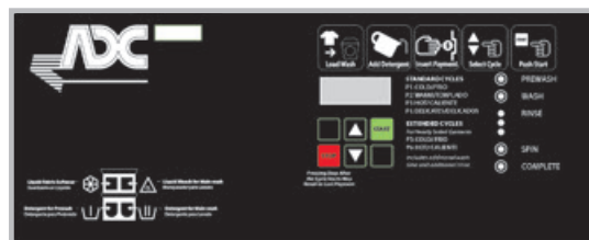
MR2 Controller—Card Ready